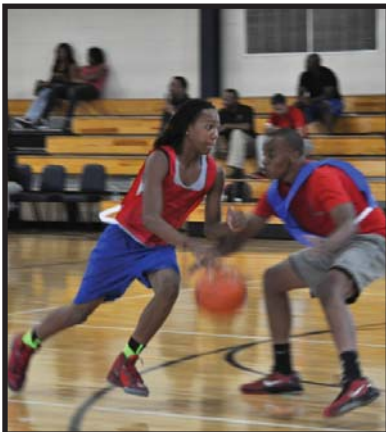
Snapshots from select age group games before championship game