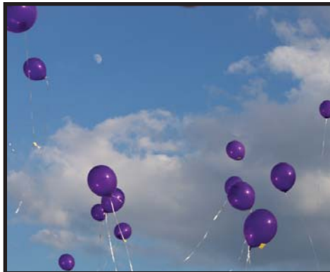
Balloons signifying September's "National Substance Abuse Awareness month"